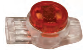
UR & UR2 3 PORT