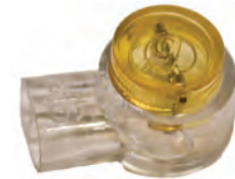
UY & UY2 2 PORT