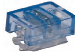
UB 2 PORT